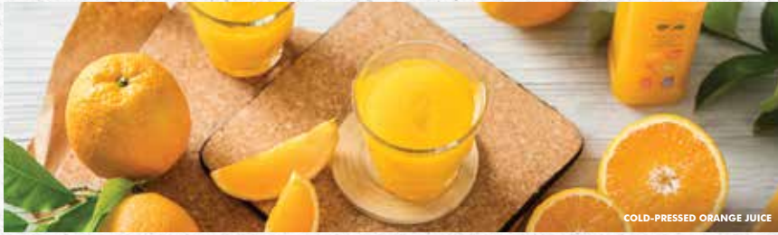
COLD-PRESSED ORANGE JUICE