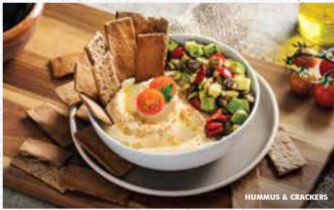
HUMMUS & CRACKERS