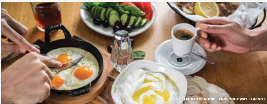
LAHMEH BI AJJINE • EGGS YOUR WAY • LABNEH

COLD PRESSED BOOST SHOTS: FRESHEN UP, CHARGE UP OR FIRE UP. THEY SUPPORT GOOD HEALTH & BOOST IMMUNITY & ENERGY