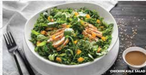
CHICKEN KALE SALAD

A BRIGHT MIX OF BAKED POTATO SLICES, BEANS, BOILED EGG, TOMATO, CORN, BLACK OLIVES, TUNA & LETTUCE. BEST ENJOYED WITH MUSTARD VINEGAR DRESSING