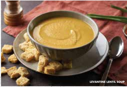
LEVANTINE LENTIL SOUP